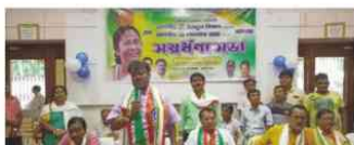
নদিয়া জেলা পরিষদে সংবর্ধনা অনুষ্ঠানে দুই মন্ত্রীর আক্রমণ বিজেপিকে