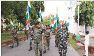
সিআরপিএফের স্বাধীনতার মহোৎসব র্যালি

নিজস্ব প্রতিবেদন, মেদিনীপুর: স্বাধীনতার ৭৬ বছর পূর্তিতে আজগুড়ি... (Text continues with a report on the CRPF Independence Day rally)